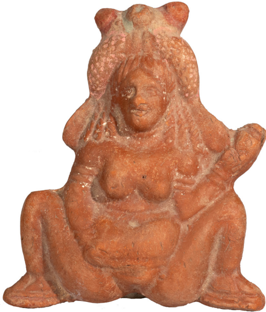
Figure 1. A nude female figurine holding a small globular pot from Tell-Basta (Cairo, Grand Egyptian Museum, GEM 68271)

6/ A headless nude woman sitting on a stone or night stool (?), she holds a vessel with straight handle in her right hand, while she points her left hand toward her genitals. There is a small oval pot with vertical rim beneath her in the middle of the base (fig. 6) (Provenance: Fayoum; Alexandria, Graeco-Roman Museum, inv.10019). 6