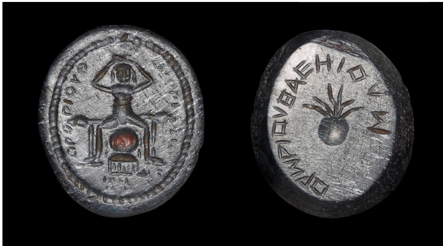
Figure 7. Uterine gem representing on one side an inverted round pot closed by key beneath the figurine of Omphale (London, the British Museum, inv. G 1986,0501.32)

This representation of Omphale on the gems recalls the ancient Egyptian story of Isis when she gave birth to her son Horus in the marshes of the Delta, while she was fighting Seth to defend herself and her newborn. 52 This popular and traditional idea was probably transferred from the myth to the effigies of bronze, faience, and terracotta figurines in Graeco-Roman Egypt. The magical representation of “Pesudo Baubo” or probably “Omphale” according to the magical inscriptions on the Roman gems can control the evil forces that threaten the mother and newborns. It seems from these evidences that there is a strong connection between the Egyptian and Greek conceptions concerning the ideas of the protection of motherhood and childbirth.