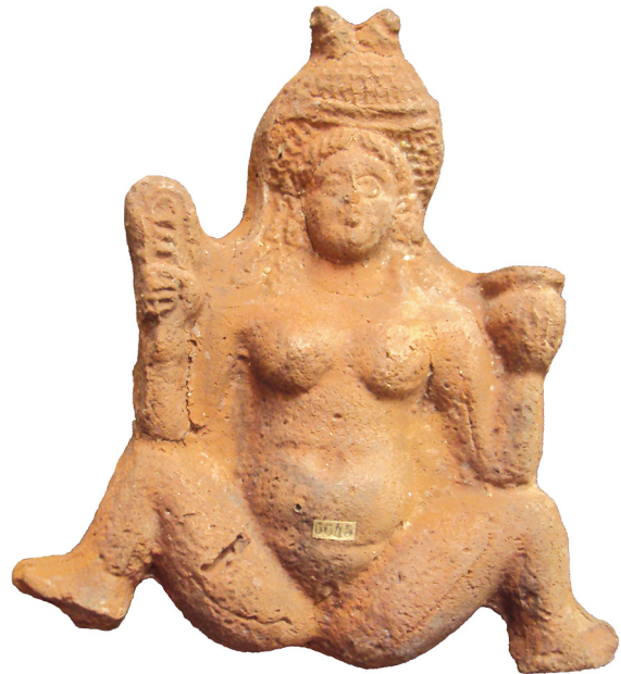
Figure 2. A nude female figurine holding a small globular pot and sistrum (Paris, Bibliothèque nationale de France, inv. 52,5645)