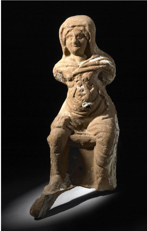
Figure 9. A draped female seated on pierced vase (London, British Museum, inv. GR.1992.8.11.1)