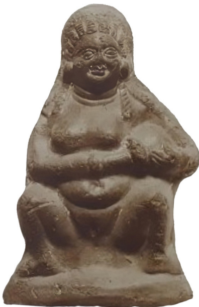
Figure 3. A nude female figurine holding a globular pot (Alexandria, Graeco-Roman Museum inv. 7510) [After BRECCIA 1934, pl. LIII, 262]