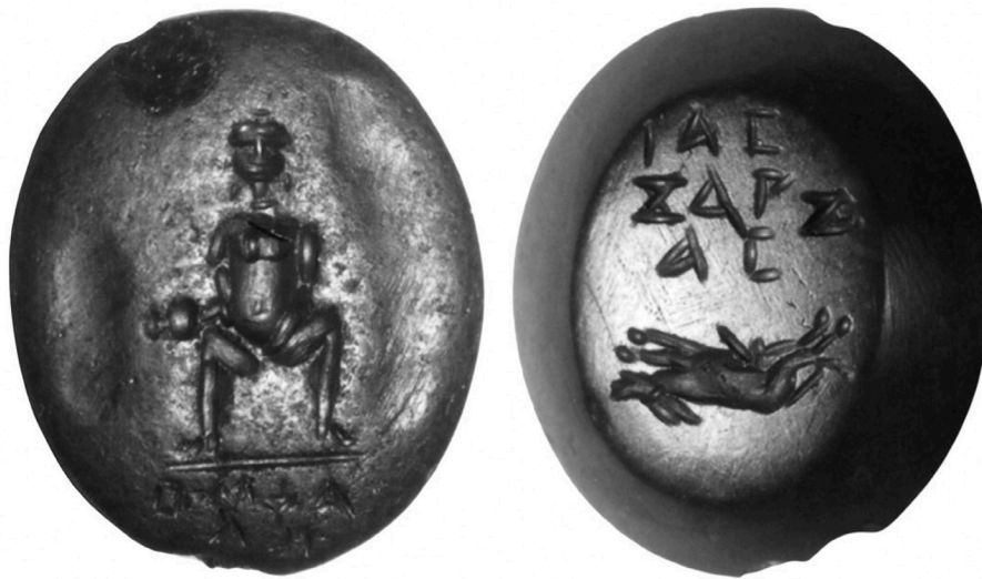
Figure 7. Red jasper uterine gem representing on one side a nude figurine holding a small globular pot (Hamburg, Skoluda collection) [After DASEN 2008, p. 267, fig. 2]

Some uterine gems depict Omphale on one side as a squatting woman in frontal position with legs apart and holding a small globular pot in her right hand, while on the other side an ithyphallic donkey lies down with erected phallus. Next to it, there are some magical inscriptions (fig. 7). 49 In some other gems, the women's womb is represented as an inverted small globular