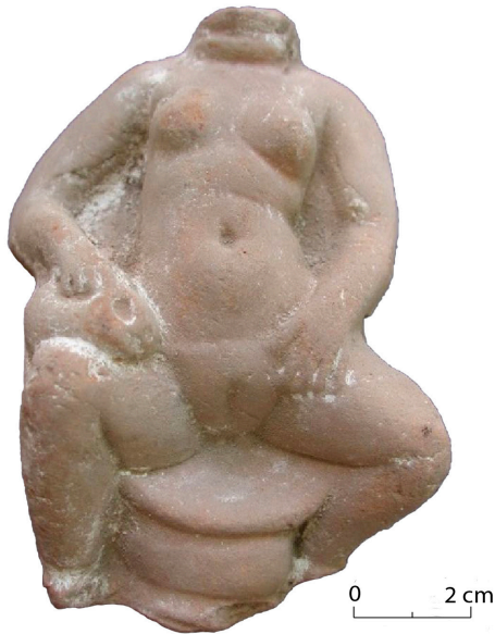
Figure 5. A nude woman holding an Askos -pot and sitting on a pierced base (Alexandria, Graeco-Roman Museum, inv. 31161) [After IBRAHIM 2021, p. 660, fig. 2]