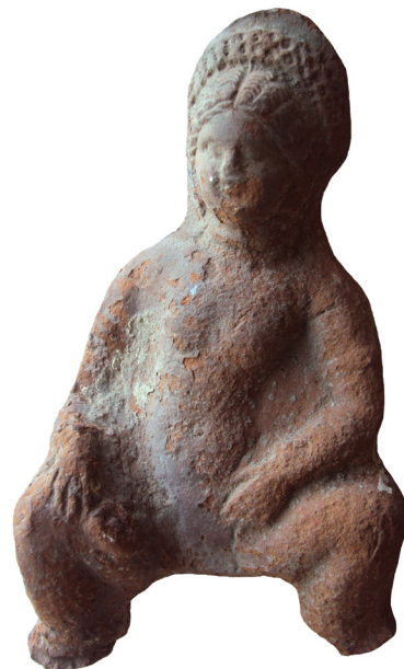
Figure 4. A nude woman holding a vessel with straight handle in her left hand (Brussels, Art and History Museum, inv. E.01222) [After PETRIE 1904, pl. L, 108-109]